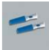
White Sample Port