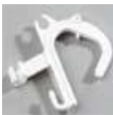
Reinforced Double Hanger