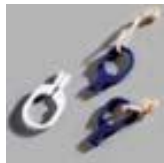
Bed Sheet Clamp