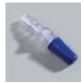
Needless Sample Port