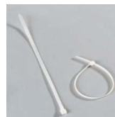
Disposable Plastic Hang Tape