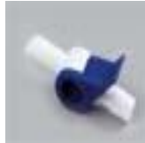
Single Reversal Valve