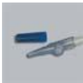
Needless Sample Port