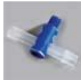
Big T Valve