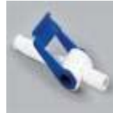
Double Reversal Valve