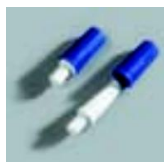
Liquid Afflux Connector