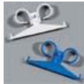
Reinforced Double Hanger