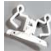
Reinforced Double Hanger