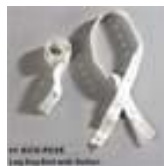
Leg Bag Belt with Button