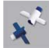
Luxurious T Valve