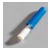
Liquid Afflux Connector