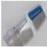
Needless Sample Port