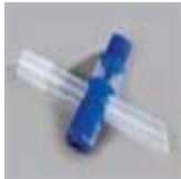
Small T Valve