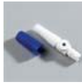
White Sample Port