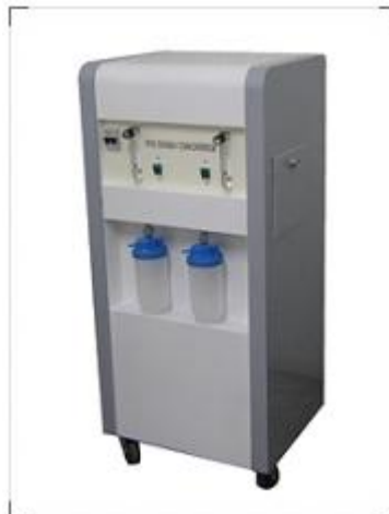
FY10 / 10W